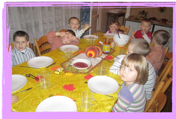
Orphans at the Pope Pius XI Home For Children.

Service Partners: Felician Sisters, Oblate Sisters & your Field Coordinator.