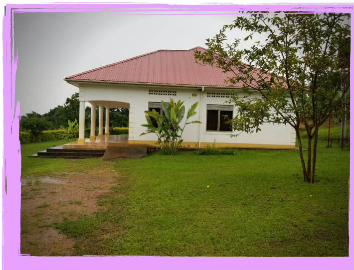
One of the Houses in Uganda where volunteers, service workers & college students can stay.

Service Partners: Sisters, teachers, guardians, matrons of the community, and your Field Coordinator.