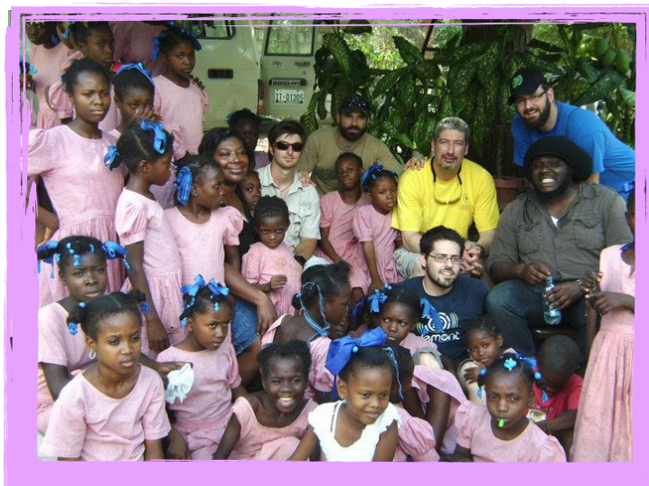
Past CARITAS volunteers with children in Cazeau.

Service Partners: Sisters of the Convent in Cazeau where service workers will stay & your Field Coordinator.