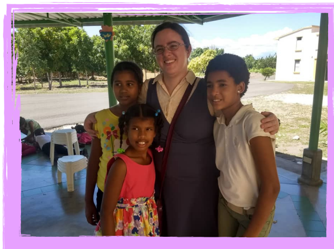
A CARITAS intern with students in Azua, D.R.

Service Partners: Sisters of the Convent & your Field Coordinator.